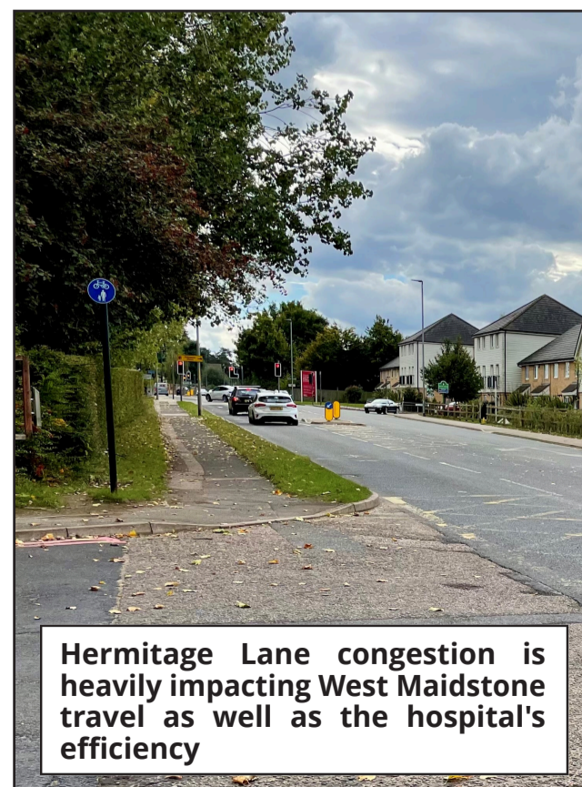
Hermitage Lane congestion is heavily impacting West Maidstone travel as well as the hospital's efficiency