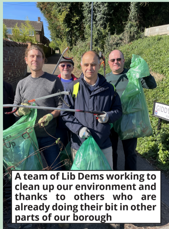
A team of Lib Dems working to clean up our environment and thanks to others who are already doing their bit in other parts of our borough

Local Lib Dems have been tackling litter and fly-tipping in areas like Giddyhorn, Buckland Lane, Oakwood Road, and more. All collected waste was swiftly removed by the Borough Council.